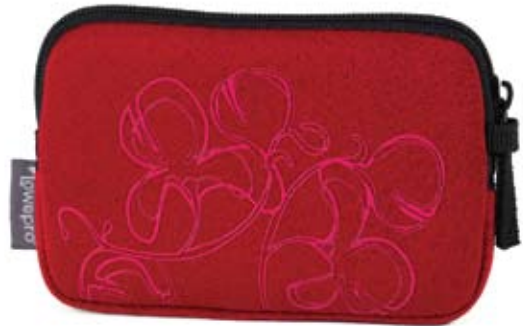
Shown in Red