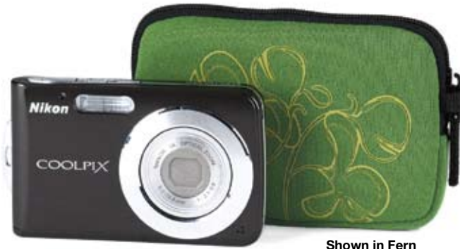
Shown in Fern