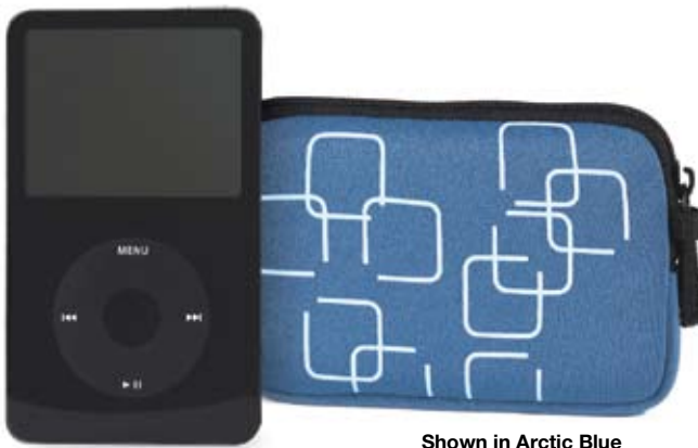
Shown in Arctic Blue